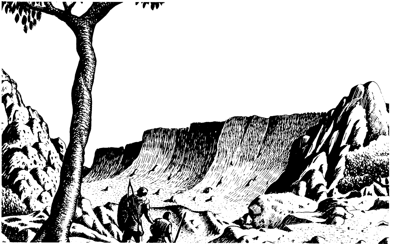
Jonathan and his armorbearer went boldly down into the valley, trusting God to defeat the Philistines.

God did not need a huge army to defeat the Philistines.