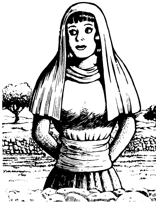
Ruth set a good example with her hard work.

Ruth set a good example that we can all follow: work hard with all your might and you will be blessed. Ruth was given a raise by Boaz. She didn’t know it, but the extra grain or corn was a bonus for her hard work.