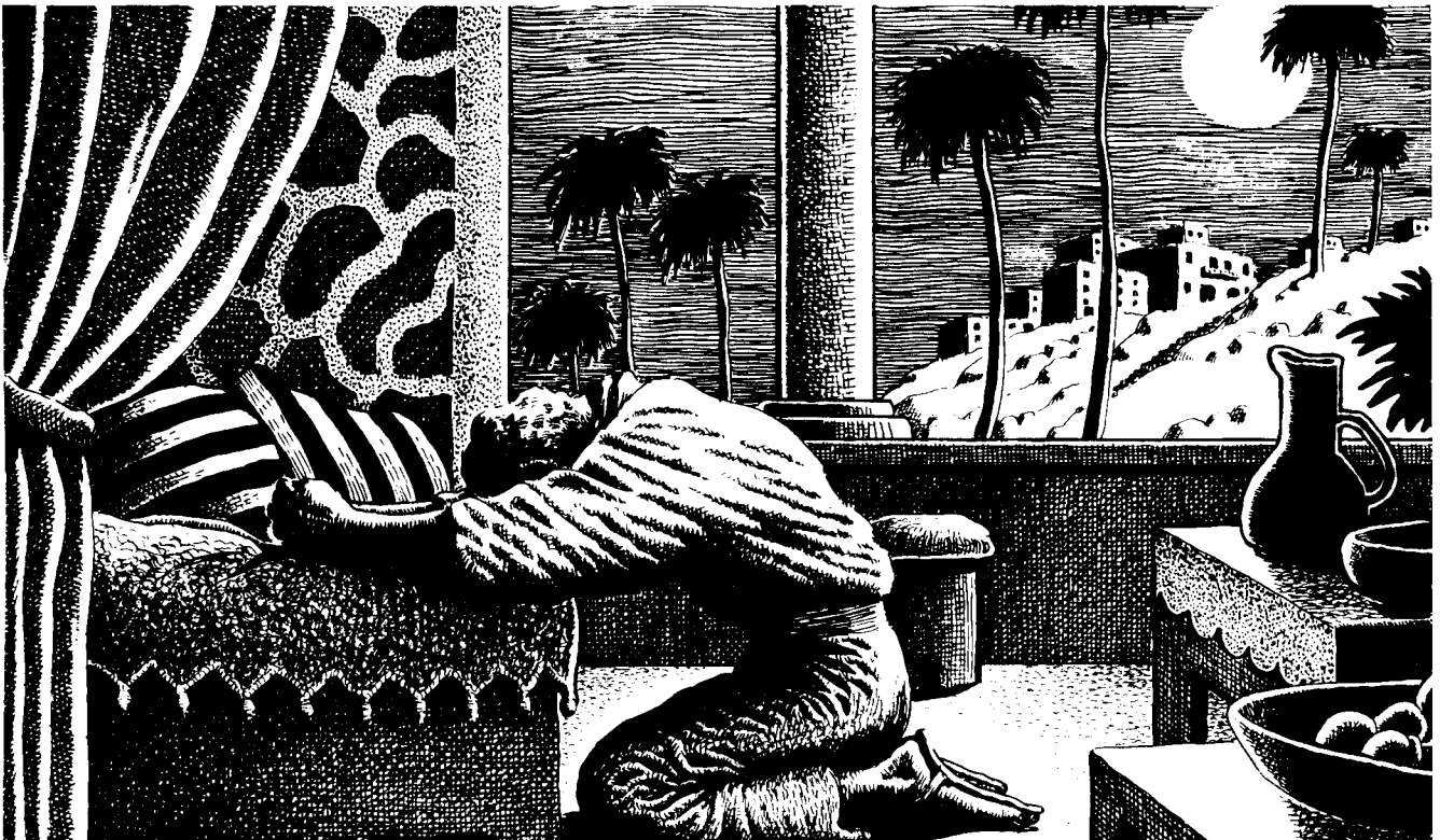
Whenever Samuel needed help, he prayed to God and asked what to do.

So Samuel told them everything. He told them what a king would do: take their sons to fight in his army, their daughters to be his servants and cooks; take their fields and vineyards, their sheep and cattle. Whatever the king wanted, he would take from them (I Sam. 8:11-18).