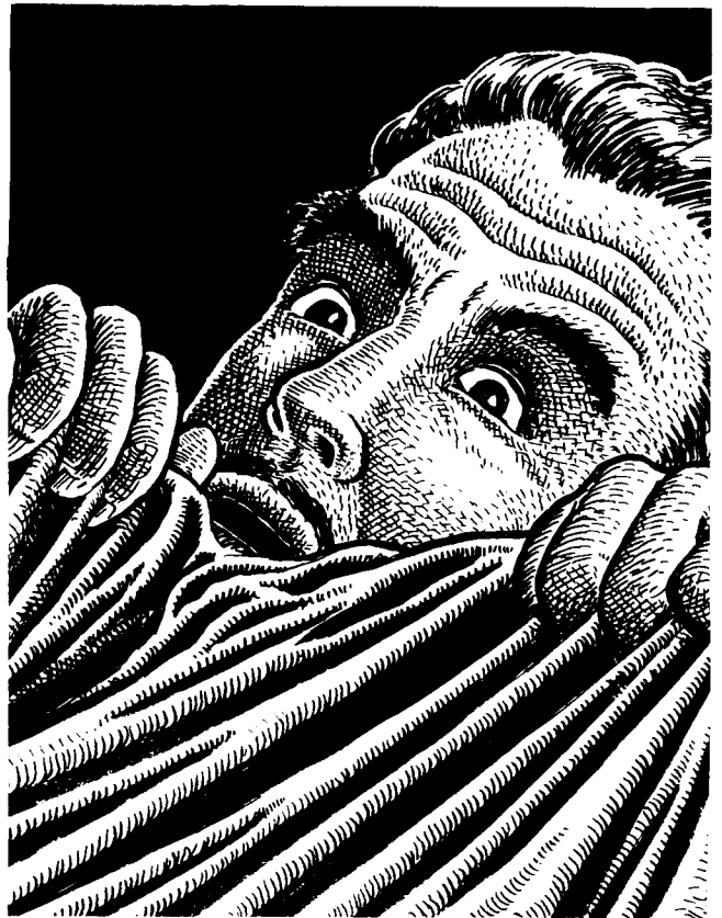
Boaz awakened after midnight to feel something pressing against his feet!