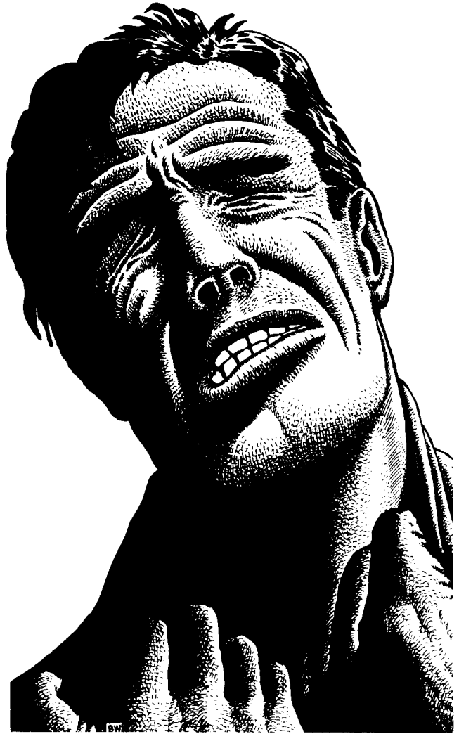
Because Saul was disobedient, God rejected him as king of Israel and withdrew His protective spirit from him.

The story of David's kingdom and the trials he had to go through before he received the kingdom will begin in Lesson 3.