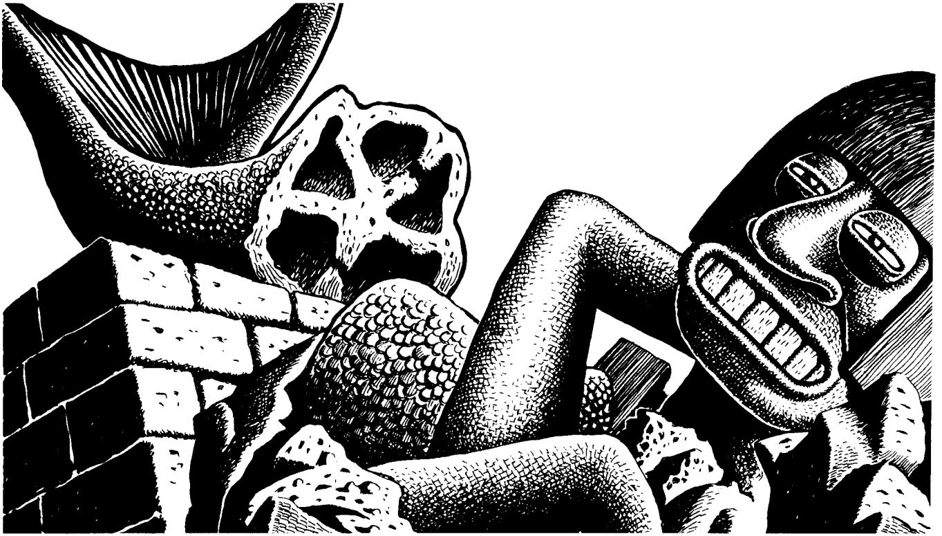
The Priests of the temple of Dagon were shocked to find their idol had fallen toward the ark, and the arms and head were broken off.