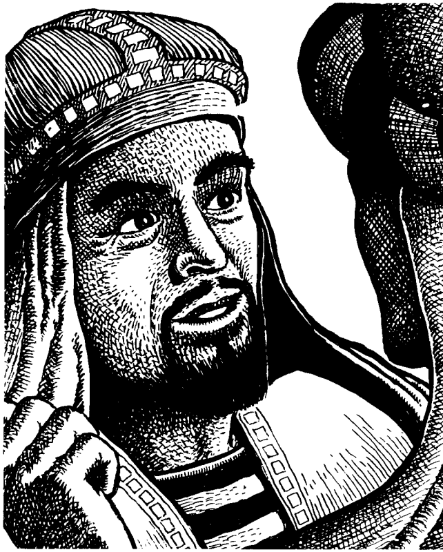
Boaz instructed the harvesters to leave a little extra grain for Ruth to gather.

In fact, Boaz was so pleased he told Ruth: “Don’t go to any other fields to glean. You are always welcome here.”