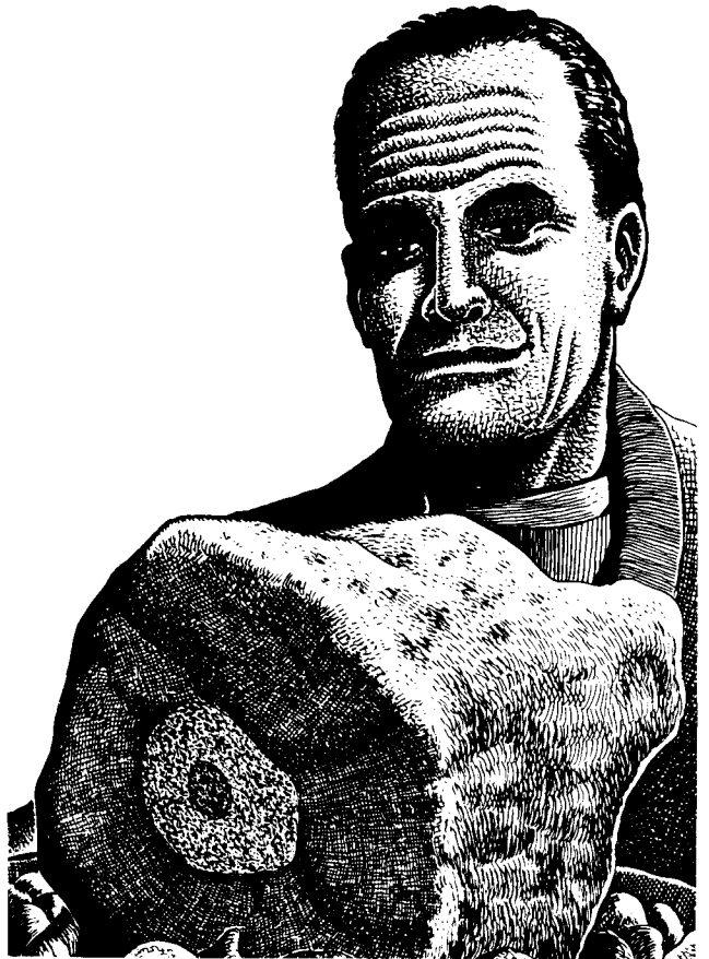
Saul was placed at the head of the table as God’s newly appointed king of Israel.

received God’s Spirit, Samuel called all of the people together. When lots were cast for all the people, Saul’s name was taken. This was God’s way of showing Israel whom He had chosen as king.